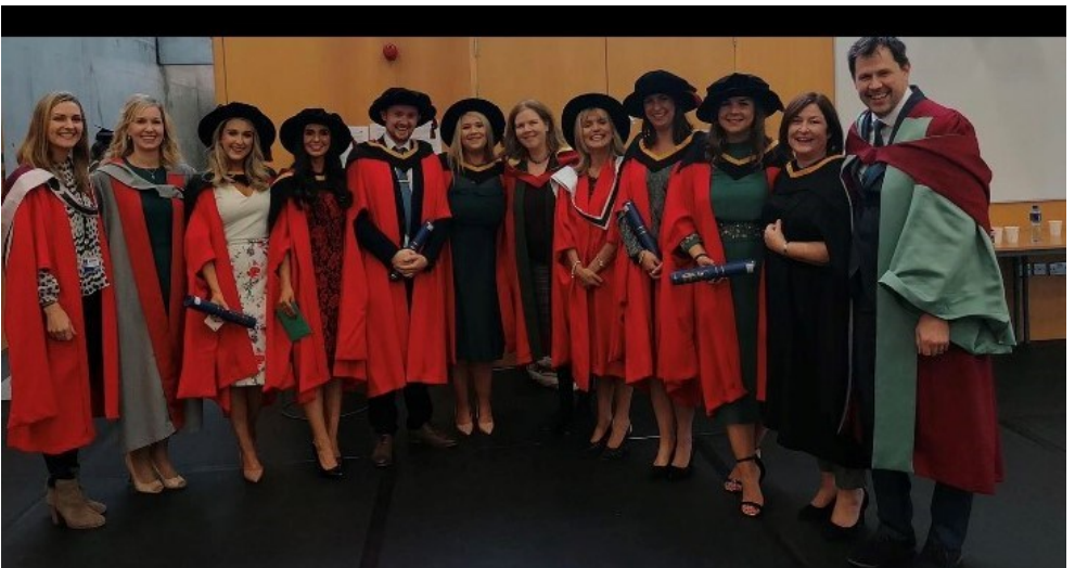
Class of 2019 with members of the team and their supervisors