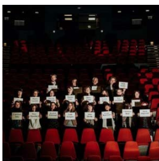
Women in Irish theatre: no more waiting in the wings