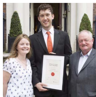
Trinity graduate becomes second-ever Irish awardee of World Chemistry Congress